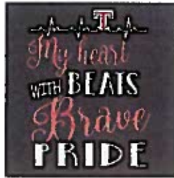
DESIGN # F19-2 - NAVY