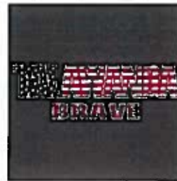
DESIGN #F19-4 - NAVY