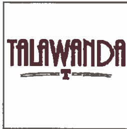
DESIGN # F19-1 - WHITE