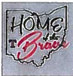
DESIGN # F19-3 SPORT GREY